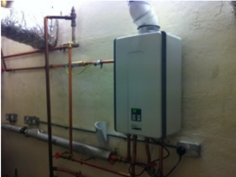
The AQUABION® now in place protecting the RINNAI hot water heater

Meanwhile a quick check of the display to see if the scale warning code is flashing, shows that after a period of 4 months the full flow is still guaranteed.