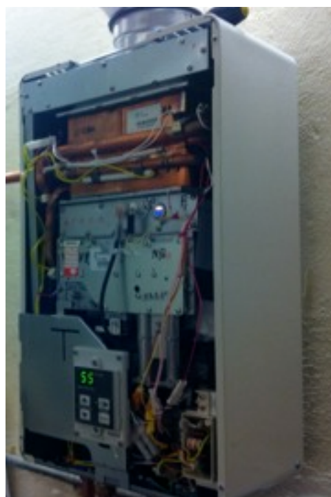
The RINNAI was under constant repair

The water hardness was about 340 ppm which was supplied by Wessex water who recorded the hardness at 310ppm (17.36° dh)