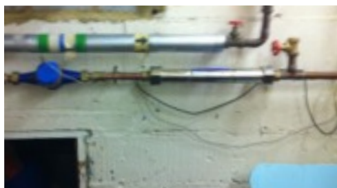
Other water treatment systems did not stop the Rinnai warm water heater from scaling up

When James Ridout of Aquabion UK arrived 2 weeks after one of the new RINNAI hot water heaters had been installed, LC was flashing on the screen, indicating that the boiler was already running inefficiently.