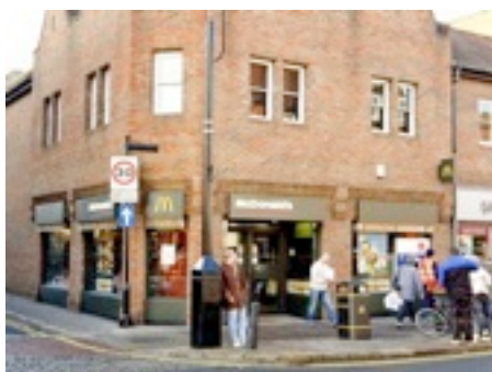
Outside view of the McDonalds

A busy Mcdonalds store on the high street in Newbury